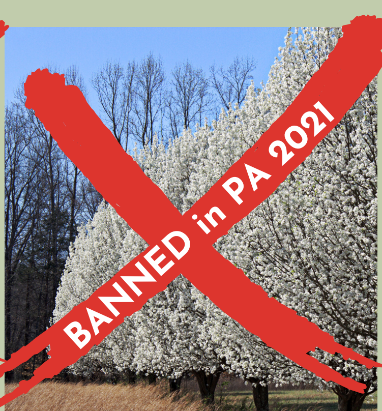
Callery Pear (Bradford Pear)