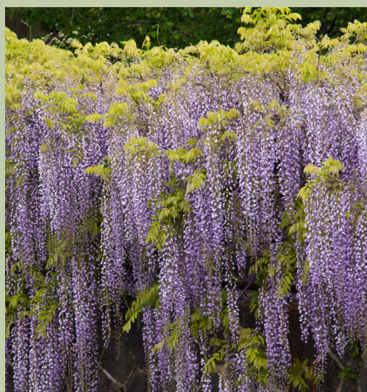
Japanese Wisteria Chinese Wisteria