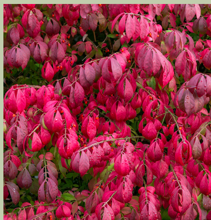
Burning Bush (Winged Euonymus)